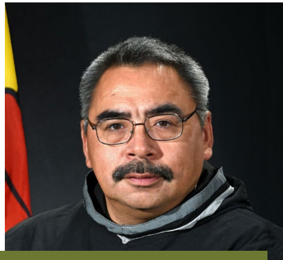
Minister David Akeegok